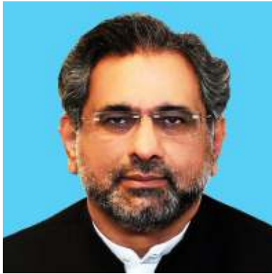
Prime Minister of Pakistan Mr. Shahid Khaqan Abbasi

“Pak-China bilateral ties are time tested; our relationship has attained new heights after the China-Pakistan Economic Corridor that is a game changer for the region and beyond.”